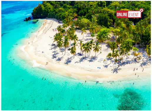
The Dominican Republic