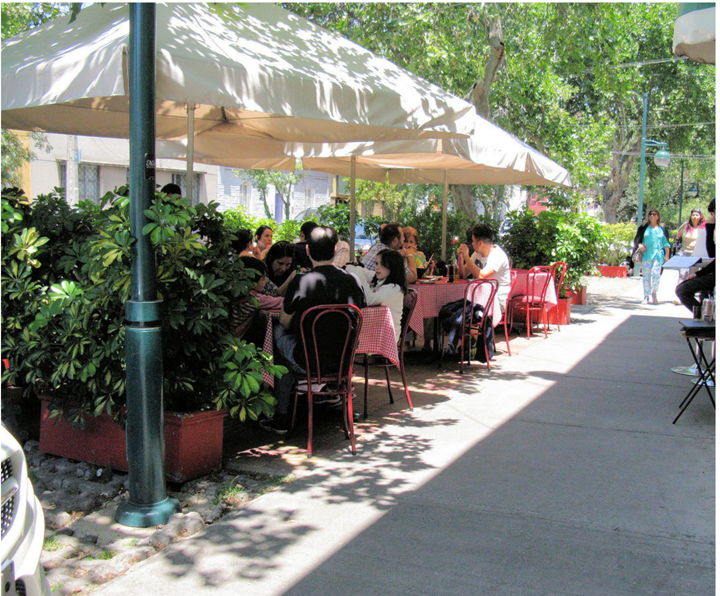
One of hundreds of outdoor dining options in Santiago

Note that while Chile does not require a background check for most applicants, they do require a background check for citizens of Colombia, Dominican Republic, and Peru.