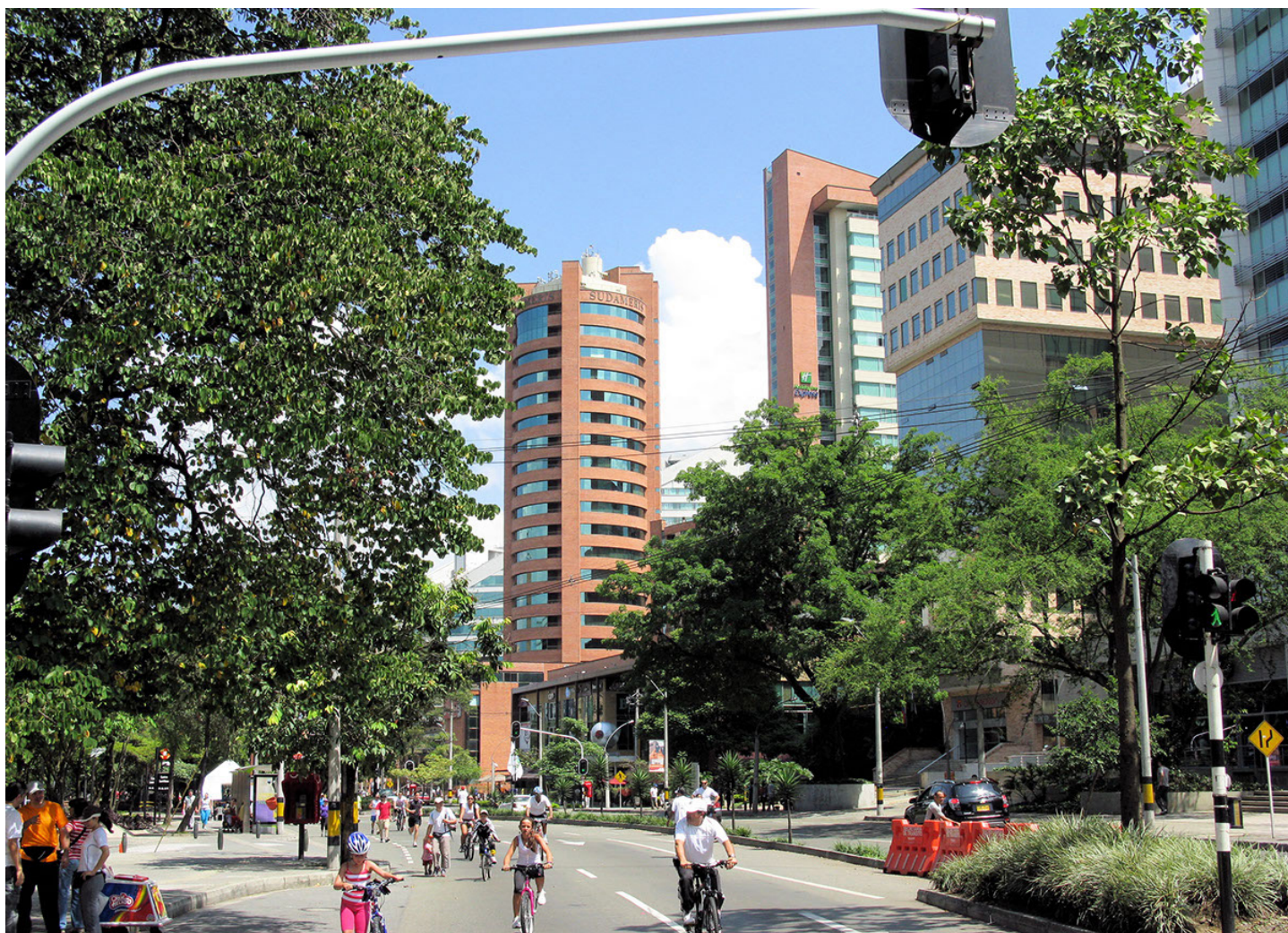
Medellín's El Poblado offers an upscale lifestyle at amazingly-low prices