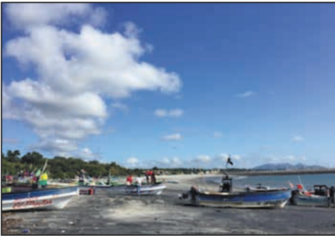
Playa Ensenada, San Carlos

Because it's a fishing village beach, it has distinct look and feel which some won't find picturesque. It's not pristine, but it is quiet and family friendly. It also has a nice view of Vista Mar Marina.