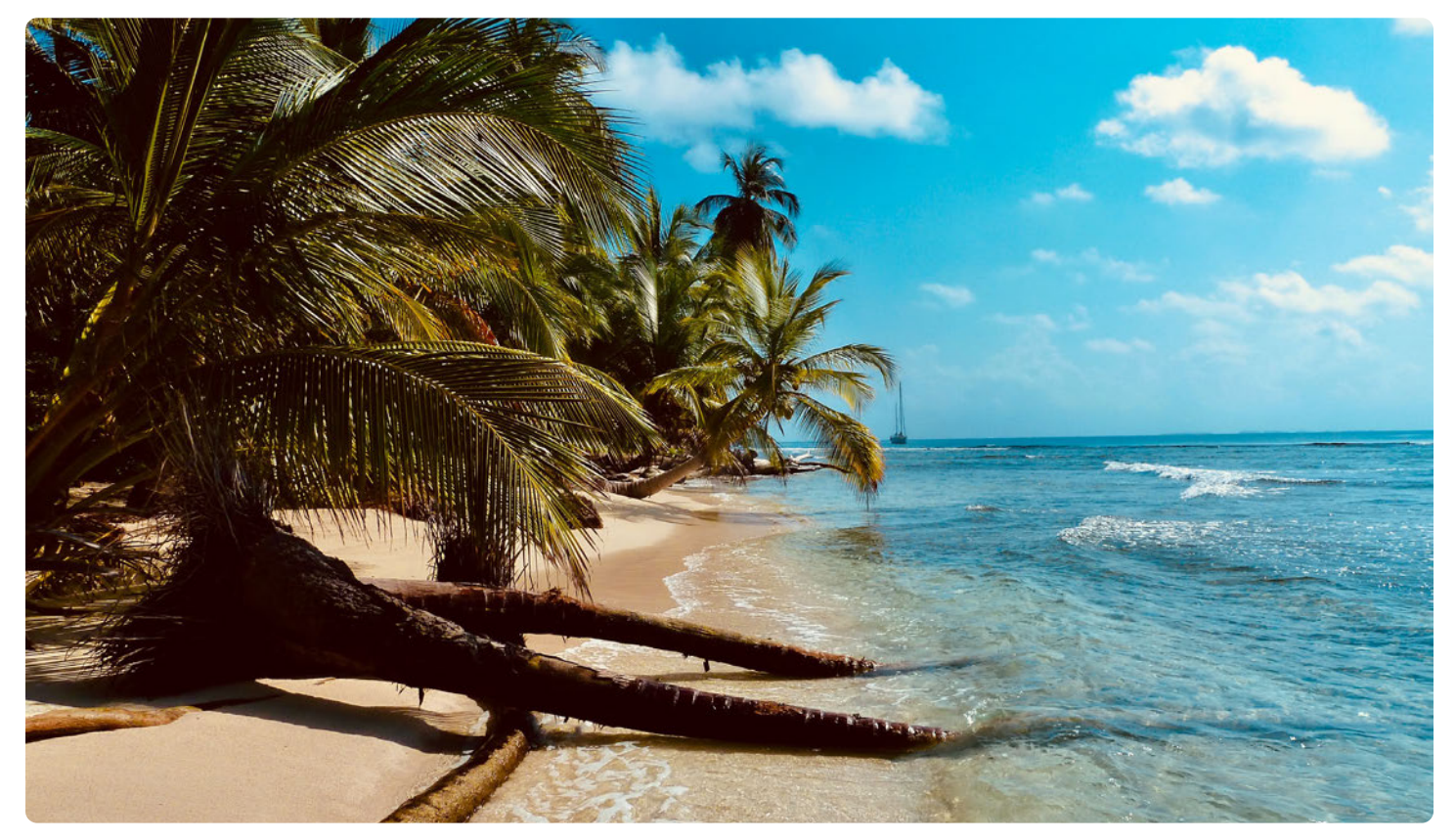
Beach in the San Blas islands

Due to Guna Yala's comarca status, the San Blas islands are strictly a tourist destination. There's no chance of purchasing a piece of land or a condo or