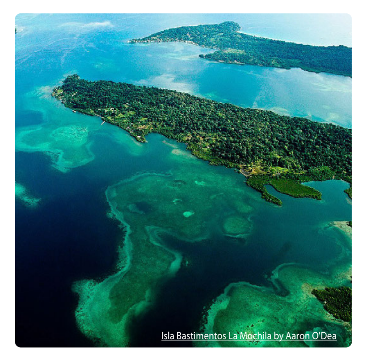
La Mochila, Bastimentos Island

Here, hawksbill and leatherback sea turtles lay their eggs. Pumas, ocelots, margays, and jaguars prowl the jungle, with more than 600 species of birds flying overhead. The Naso, Bribri, and Ngäbe-Bugle indigenous groups also live on the island.