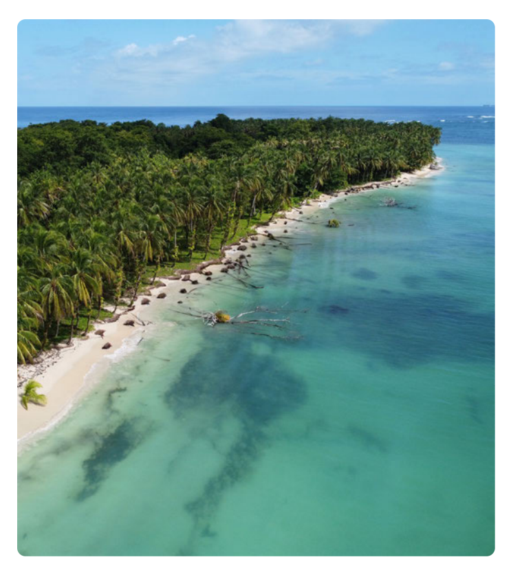
Cayo Zapatilla, Bastimentos Island

Living in town doesn't mean outdoor activities aren't readily accessible. Hiking, kayaking, snorkeling, and surfing are all options, with local professionals available for lessons and tours if needed.