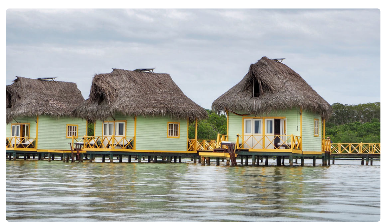
Bocas del Toro

Unlike the Guna Yala comarca , the province of Bocas del Toro doesn't prohibit residency for outsiders. For anyone looking for permanent or part-time residency, the island lifestyle in Bocas del Toro is unmatched.