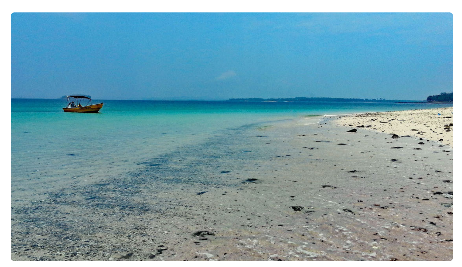
Beach in the Pearl Islands archipelago

Tourism is so frequent that The Pearl Island Times newspaper, circulated mainly in Panama City, exists solely to reach out to potential tourists.