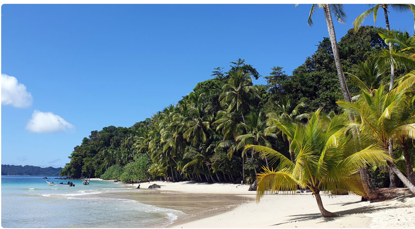
Coiba Island beach