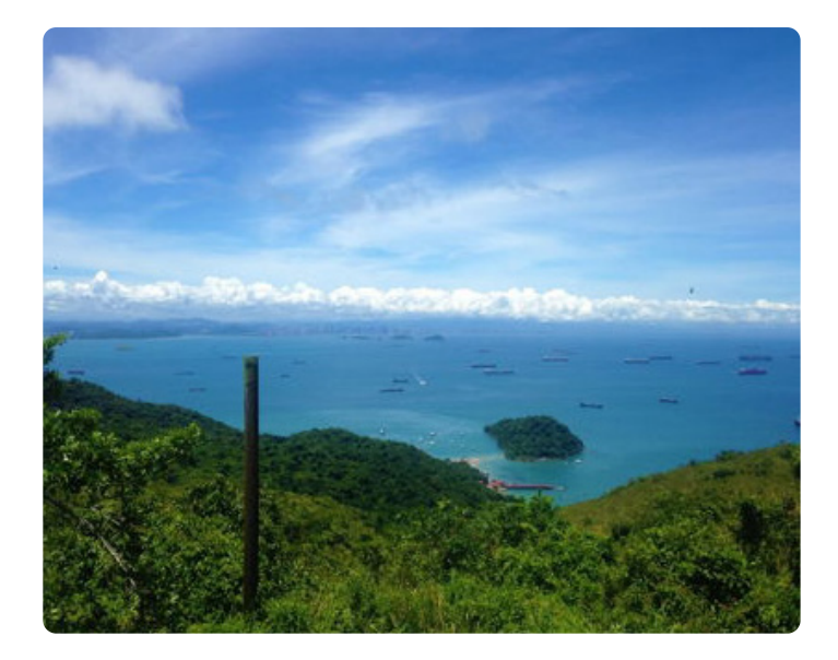
The view from Cerro Vigía

Also known as the Island of Flowers, Isla Tabgoa is blessed with a rain forest full of orchids, ferns, lianas, and bromeliads. The main town on the island, San Pedro, is blooming with nance, mango, and tamarind trees, as well as many domesticated flowers.